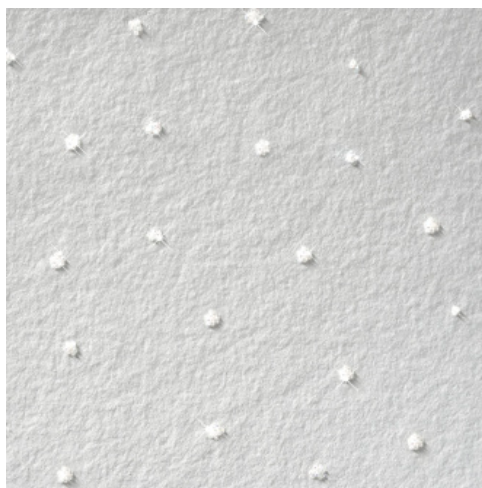
5901 White Bling