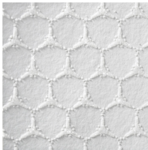
5903 White Peak