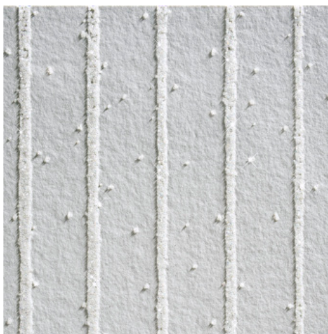
5902 White Ray