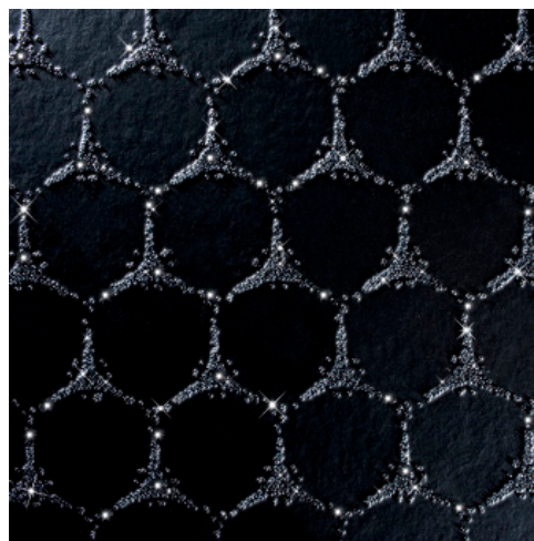
5906 Black Peak